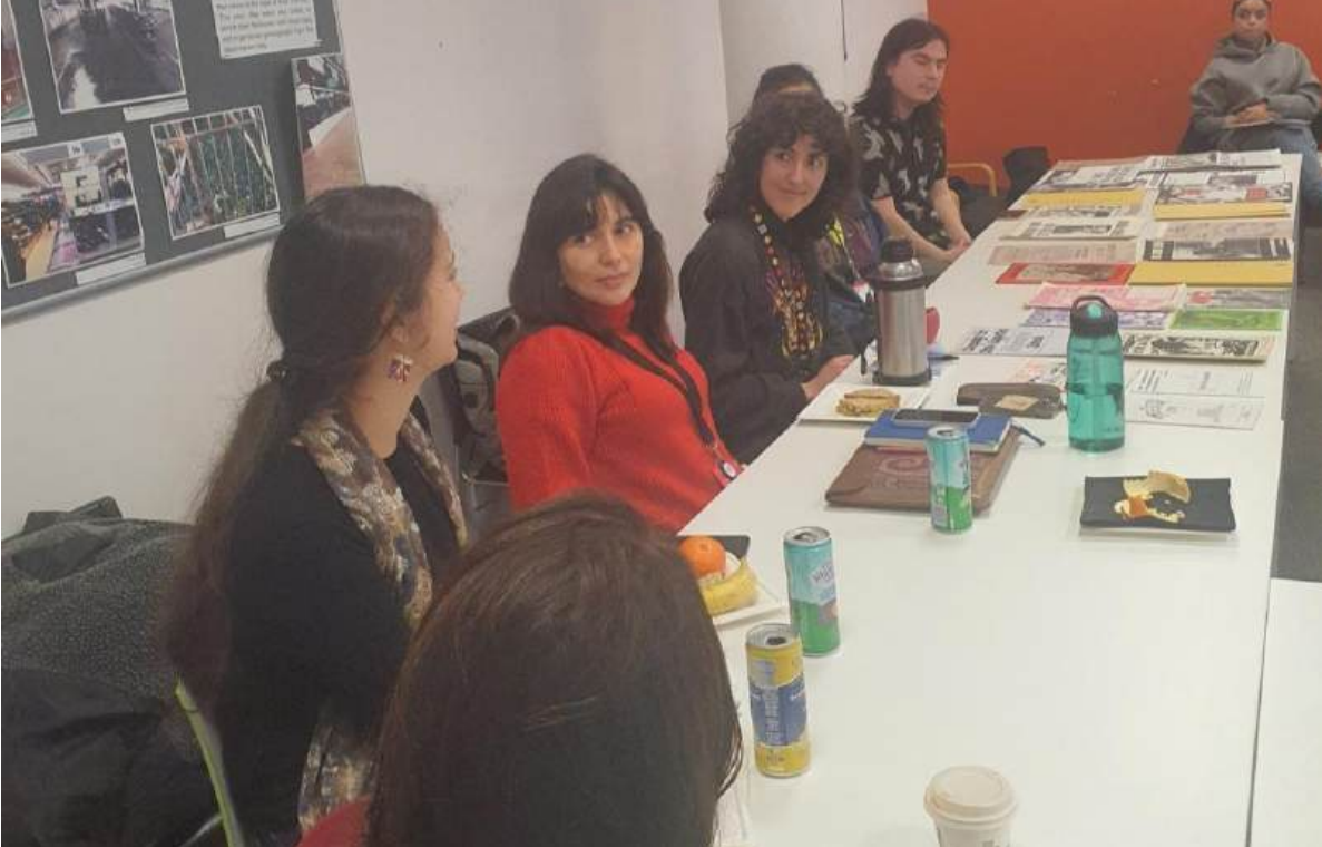
Engaging in the discussion.