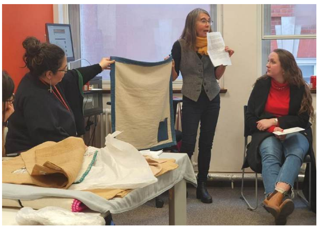
Revealing a letter from the maker, tucked in a pocket on the reverse side of <u>#SayHerName</u> (2021). This follows a practice common amongst the early Chilean arpilleristas.