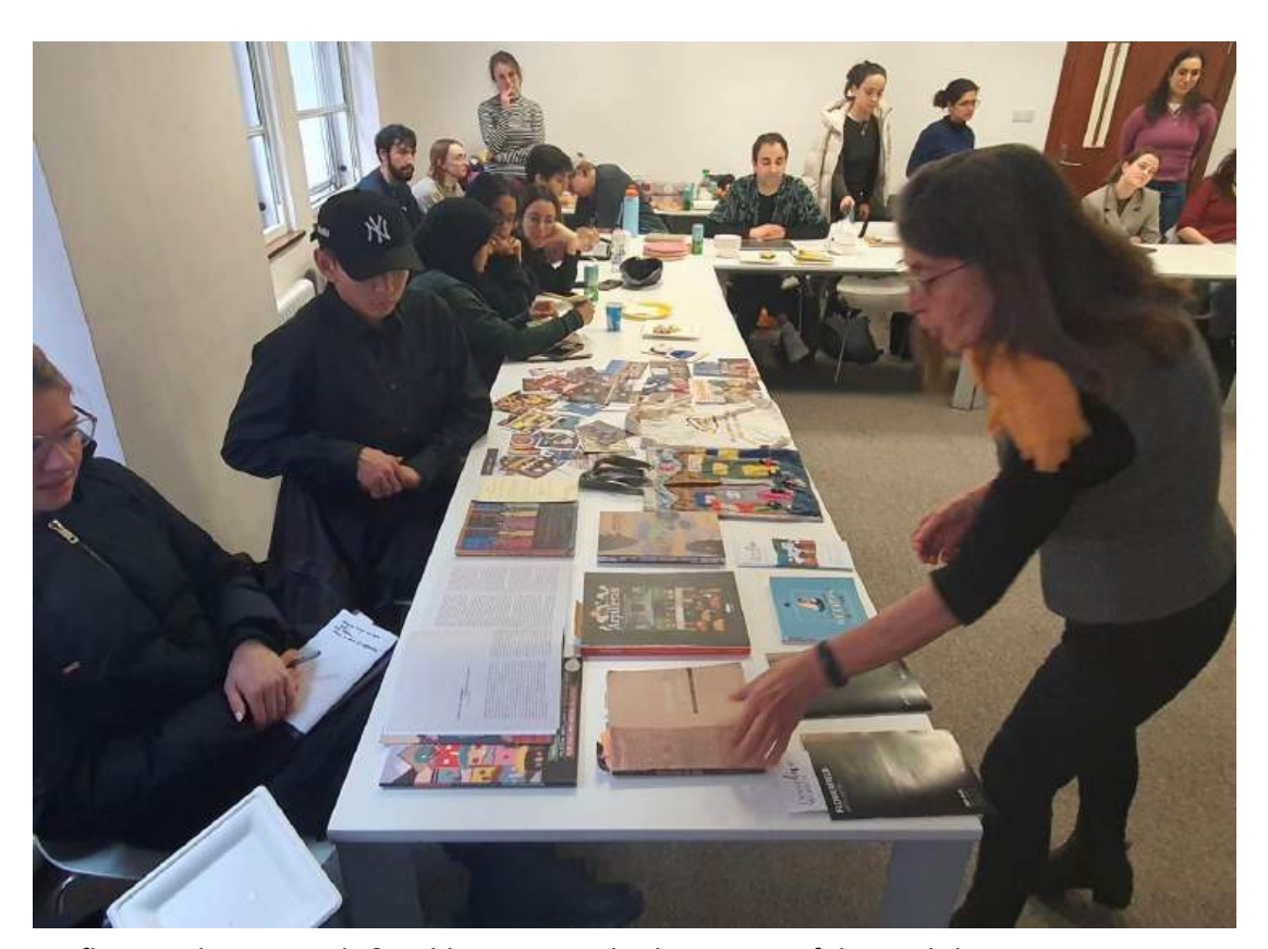
Conflict Textiles materials & publications on display as part of the workshop.