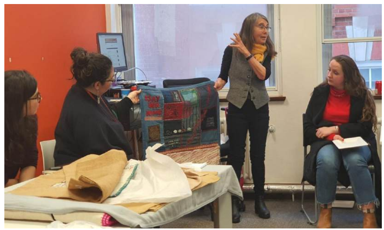
Discussing the arpillera/storycloth <u>#SayHerName</u>.