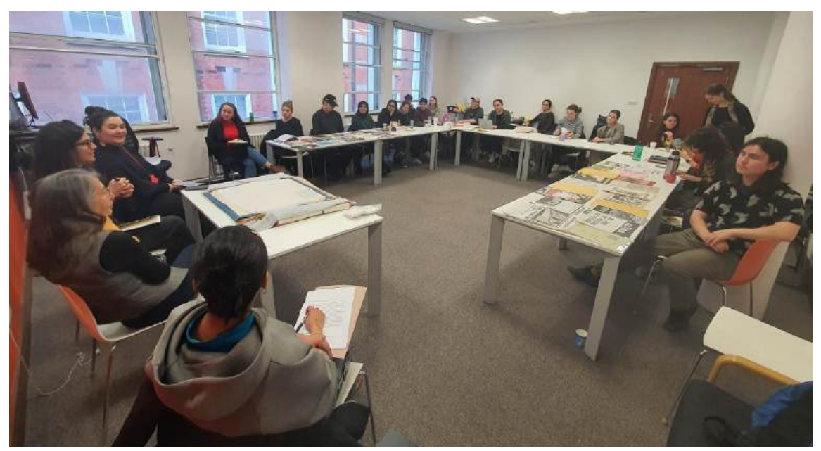
Attendees listening intently to the workshop introduction.

Both speakers focused on working with archives more creatively and what the process itself looks like. Roberta explained in-depth how Conflict Textiles - a live, evolving archive - has approached the archiving process. This was complemented by discussion and a Question & Answer session, framed around a selection of textiles displayed as part of the workshop.